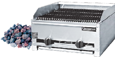
RLRB-A Series (L)