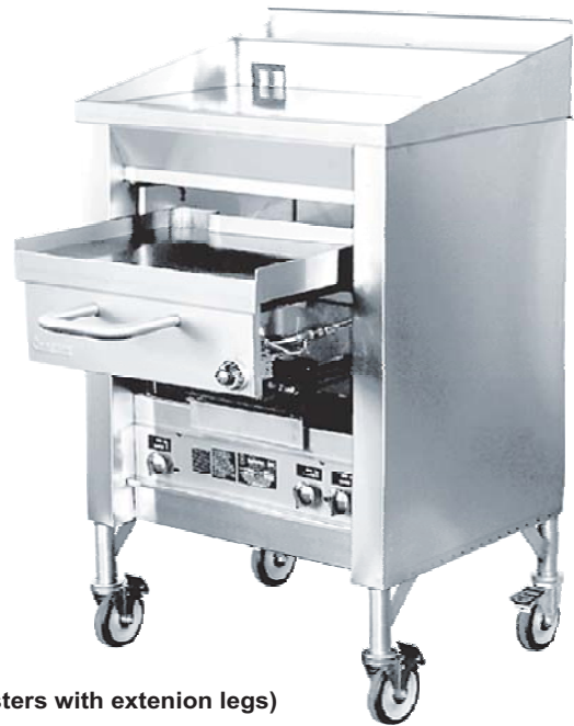
(shown with optional casters with extension legs)