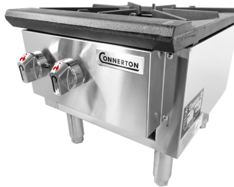
■ CSP-18-3S SHORT BODY