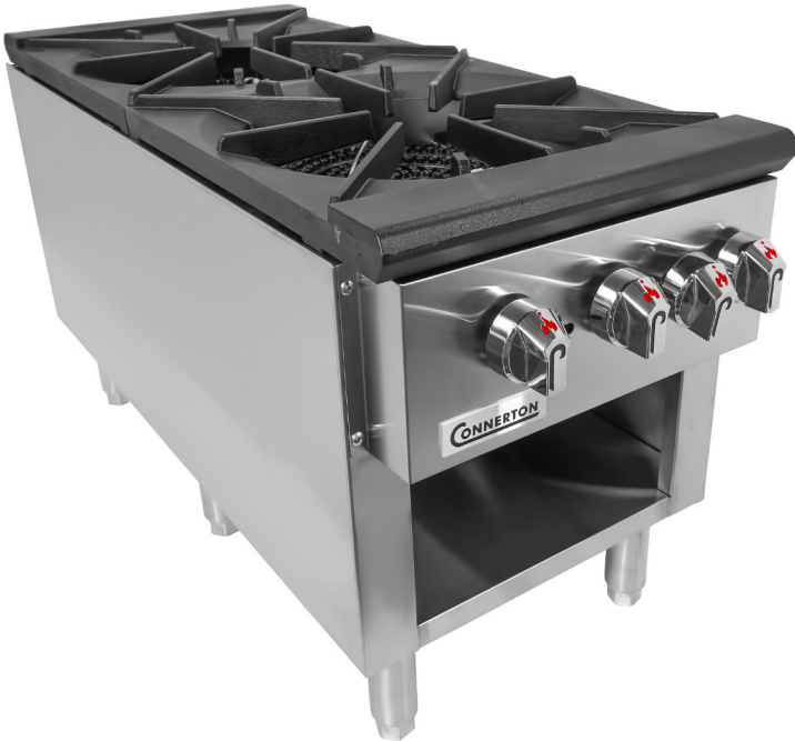
■ CSP-2-18-3 DEEP BODY FRONT/BACK BURNERS