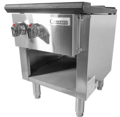
■ CSP-18-3 STANDARD BODY